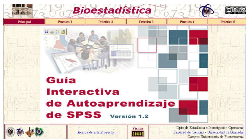
Figure 1: Web Site

The implemented emulator does not have the same functionality as the SPSS, it is more simplified. The needed options to properly perform the guided practice are the only enabled ones. The said guided practice should be carried out following the orders given in each step. With this, copying the said the above-mentioned program is not intended but an execution of a parallel and simplified application which shows a graphic interface similar to SPSS's towards the user so that when the student begins to use the said program, he becomes familiar with its environment and with part of its functionality. We could say that the computer becomes a student's virtual practice lecturer, and it will guide him throughout his learning telling him when he is wrong.